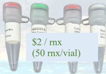
AG3337 AmeriDx® First-Strand cDNA Synthesis Super Mix for qPCR (one-step gDNA remover)