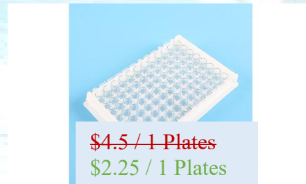
AESP-96-D 96 well, 8 strip detachable ELISA plate, PS, high protein binding, DNase/RNase free, Sterile, 10 pcs/bag