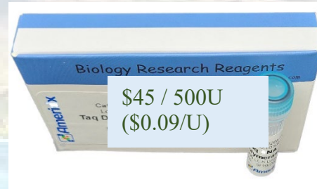
GS102057 Taq DNA polymerase, high sensitivity, and specificity